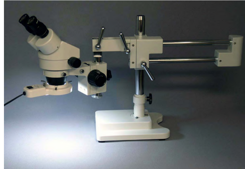
Boom stand with fiber optic illuminator