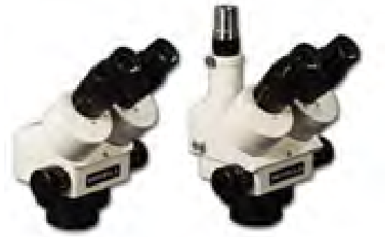
EMZ-5 Zoom 0.7x...4.5x