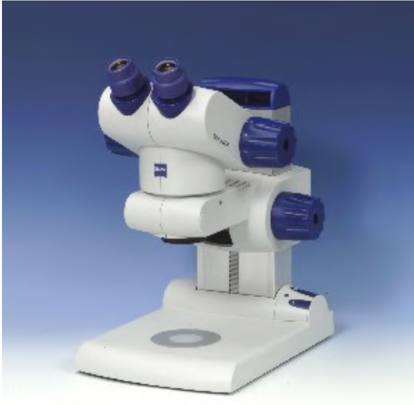
Zeiss Stemi DV4 Stand C