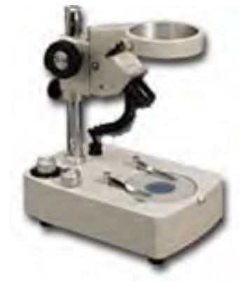
Meiji Microscope Pole Stand