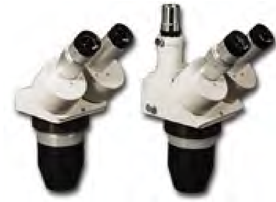
EMT-4 Dual Power 1x 4x